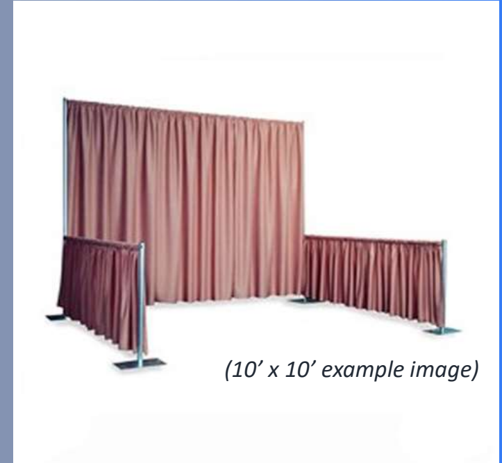
(10' x 10' example image)